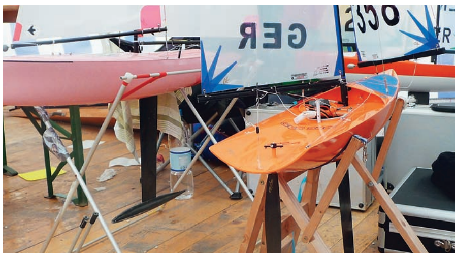
The generally light-air 2008 Europeans in Croatia were dominated by less extreme designs. Foreground left to right, Karaoke, modified Topiko and Disco designs. Second row: Extreme, Taktic and Topiko. Left: the heavily flared German Test-5s fared less well at 56th and 61st overall

designs were a lowered mast position and a raised or heavily cambered foredeck which permit each rig to be carried further up-range, thanks to the lower heeling arm and the ability to shed water when the bow is depressed on a run.